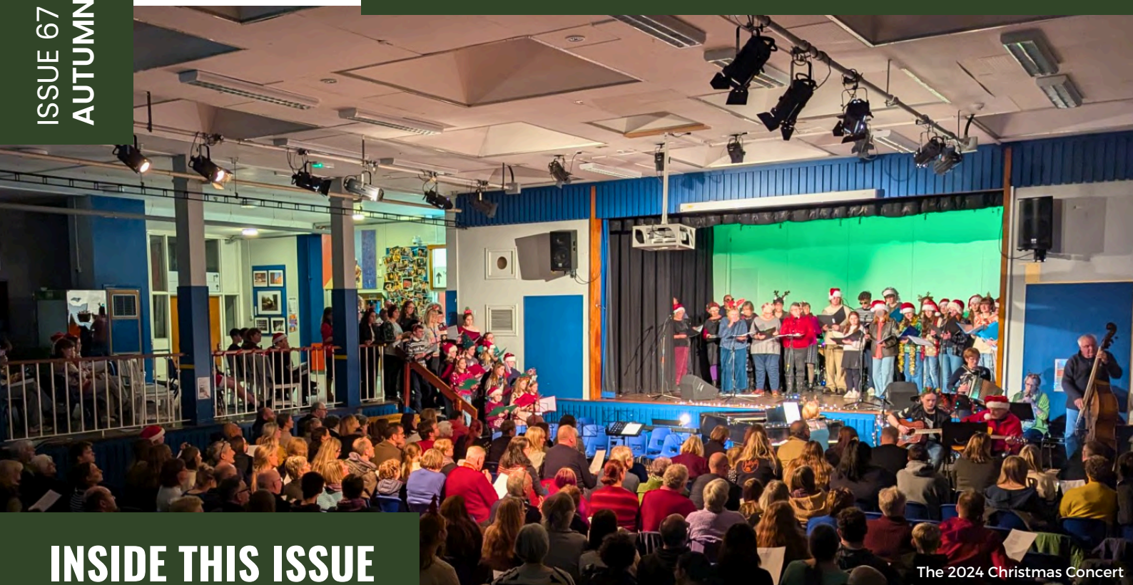
The 2024 Christmas Concert