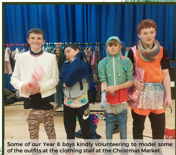
Some of our Year 8 boys kindly volunteering to model some of the outfits at the clothing stall at the Christmas Market.

Christmas Week at school was a true celebration of creativity, togetherness, and the spirit of friendship. Each event, from the performances by students and teachers to the Christmas market and concert, brought something special to the school community. It was a time for students to showcase their talents, for staff to share in the joy, and for everyone to come together in the spirit of the season. This festive week not only highlighted the importance of tradition but also demonstrated the strength of community and the power of creativity in making Christmas a truly magical time of year. Over all, Christmas Week at AGS raised over £445 for the diabetes department at Derby Children's Hospital, to help families afford essentials such as hypo treatment kits and bus fares.