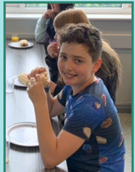
Celebratory breakfast for students in Year 7 Fearne!